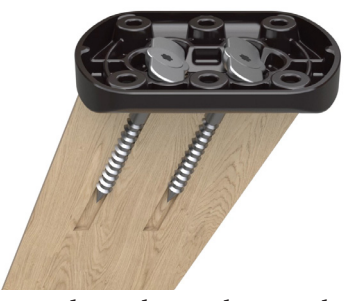
4. The nuts adjust themselves to the angle of the leg