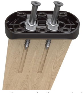
3. Fix the bracket to the leg with the 2 special wood screws