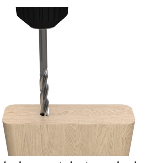
1. Drill two holes straight into the leg (Recommended hole size Ø7 x 70 mm)