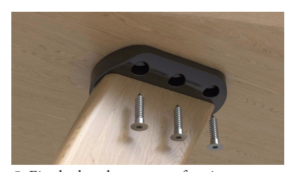
5. Fix the bracket to your furniture